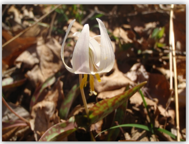
"White Trout Lily"