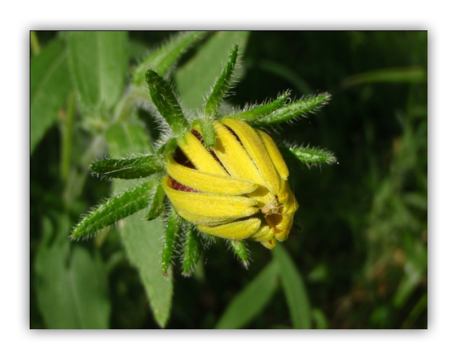
"Black-eyed Susan, closed"

Inspiration Point – No matter how much we love teaching, sometimes we could use a little help getting motivated! This section is for the teacher and includes just a few thoughts to get you interested and excited about teaching and studying the topic.