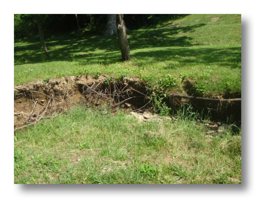
Topics: Land Erosion Caused by Water Land Erosion Caused by Weather